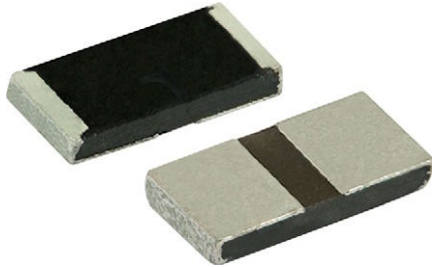
Aluminum nitride over 3 x more power - same size