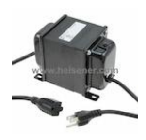
For Reference Only