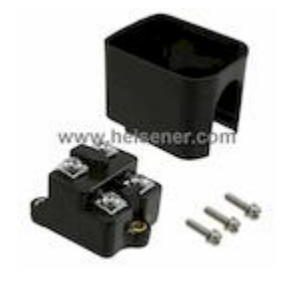
For Reference Only