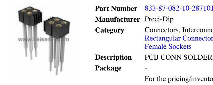
For Reference Only