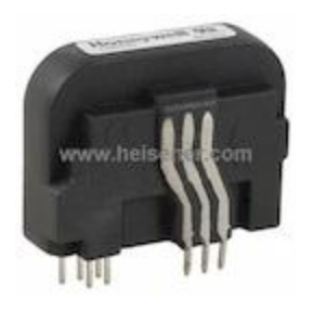
For Reference Only