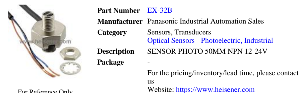
For Reference Only