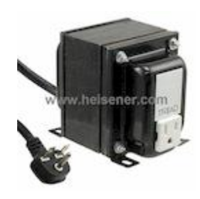
For Reference Only