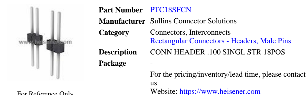
For Reference Only