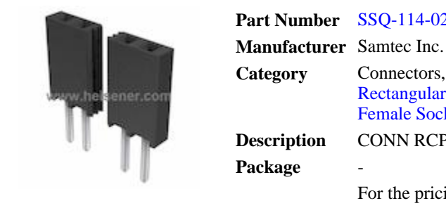
For Reference Only