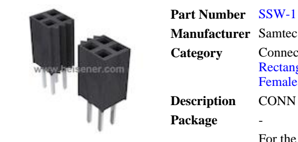
For Reference Only