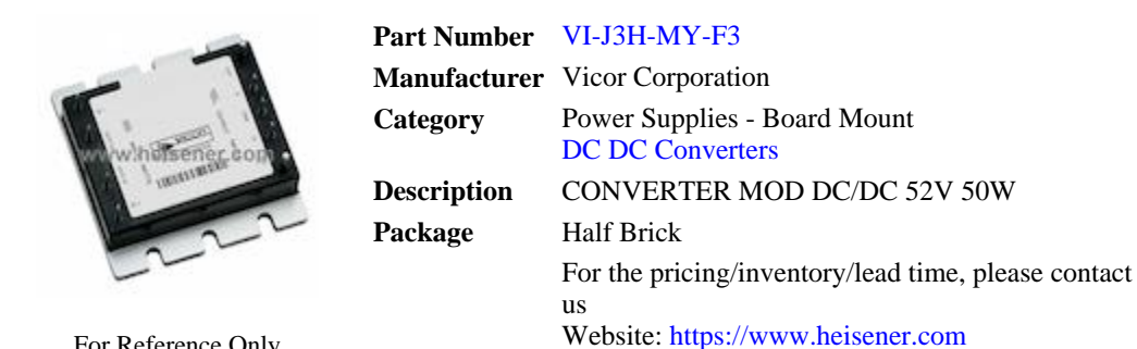
For Reference Only